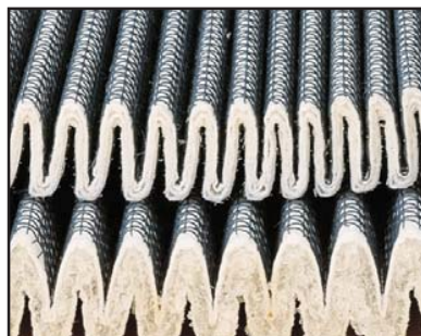
Photo above shows 'dry' Par-Gel filter media and the same media swollen with absorbed water.