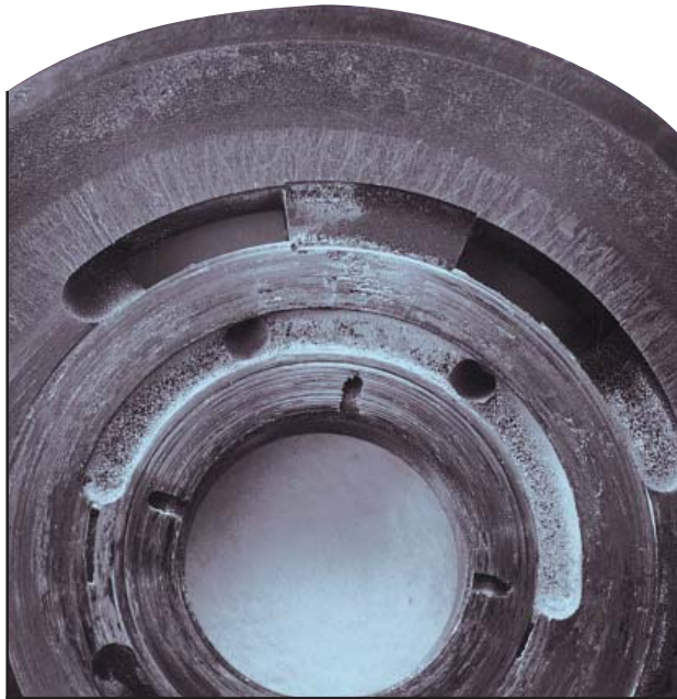
Typical results of wear due to presence of particulate and water contamination.

Condensation is also a prime water source. As fluid cools in a reservoir, temperature drop condenses water vapor on inside surfaces, which in turn causes rust. Rust scale in the reservoir eventually becomes particulate contamination in the system.