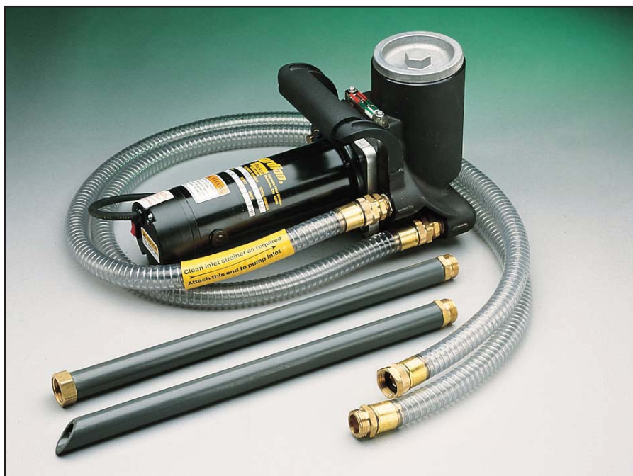
Guardian® Portable Filtration System