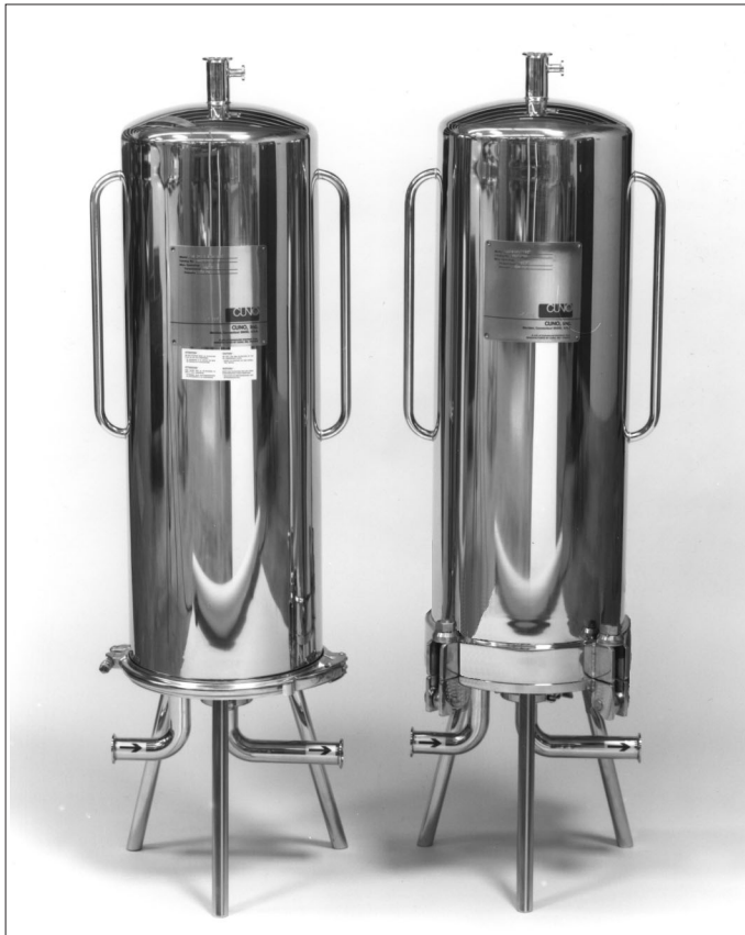
Zeta Plus Sanitary Housings: ZPC (left) & ZPB (right).

Zeta Plus Generation 2 sanitary housings provide the ultimate standard for totally-enclosed Zeta Plus filter cartridge systems. Constructed from 400 grit, mirror finish, 316L stainless steel, Zeta Plus ZPC & ZPB housings meet the exacting sanitary quality standards of the pharmaceutical, food and beverage, fine chemical, and microelectronics industries.